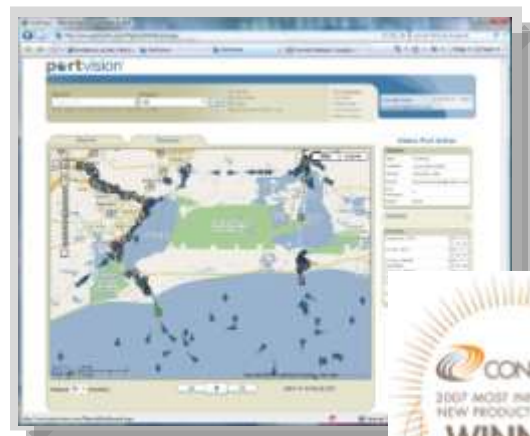
2007 Most Innovative New Product Award

AIRSIS developed PortVision , a web-based information service providing real-time visibility to commercial vessel activities. PortVision was selected as Most Innovative Product in the “Software and IT” category for 2007, the most contested category in the competition, with over 28 nominated companies competing for the award. 20 distinguished judges selected PortVision after learning how AIRSIS leveraged a government-mandated technology originally intended for ship navigation and homeland security, and leveraged it to significantly improve supply chain management and shore side logistics within the maritime industry. CONNECT is a Southern California-based technology association.